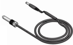
1/8 inch fine pipe thread probe with 6 foot wire that can plug into sensor.

This Stainless Steel 1/8 inch Fine Pipe Threaded Probe on a 6 foot wire allows you to just set the probe in soil, water, etc. for measurement or secure the probe wire with through a hole with the 1/8 inch Fine Pipe Thread, to prevent movement.